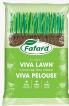
Fafard® Viva® Lawn 🛒 11 99 | 42 L. Buy 3 or more 9 99 each