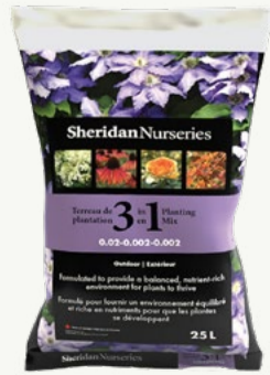
Sheridan Nurseries 3 in 1 Planting Mix 🛒 5 99 | 25 L Buy 5 or more 4 99 each