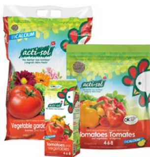
Acti-Sol Natural Fertilizer: Tomatoes & Vegetables 🛒 Starting at 19 99