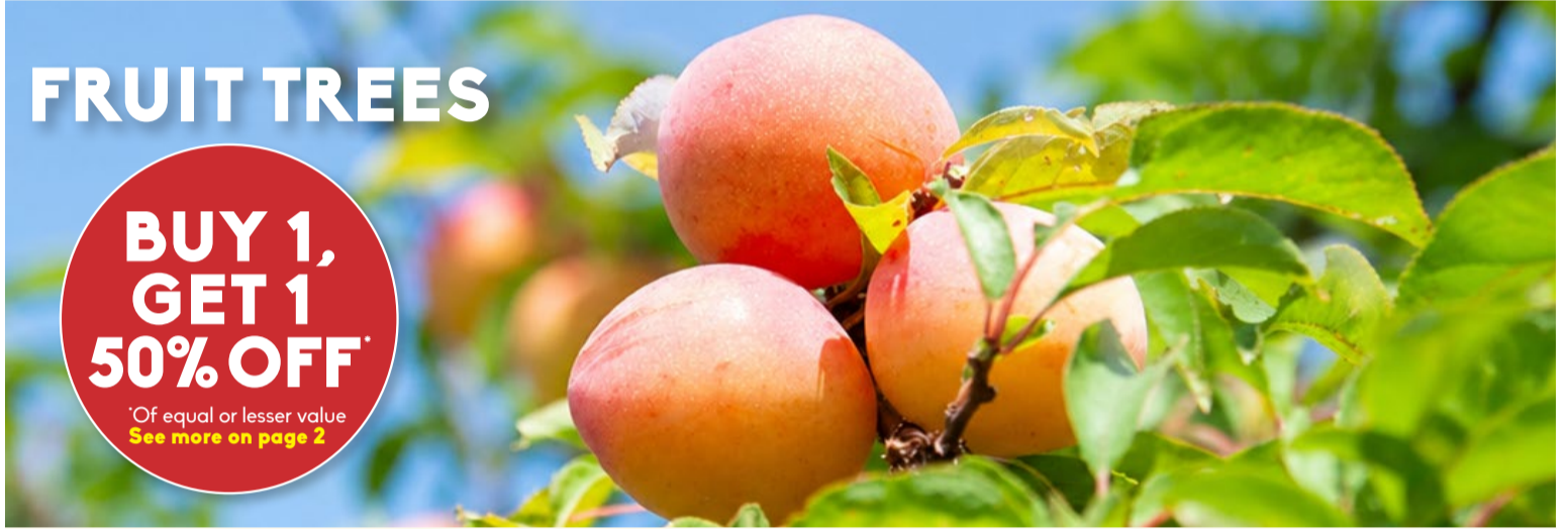
Methley Japanese Plum Dwarf Tree 🛒 129 99 | No. 7 pot

BUY 1, GET 1 50% OFF* *Of equal or lesser value See more on page 2