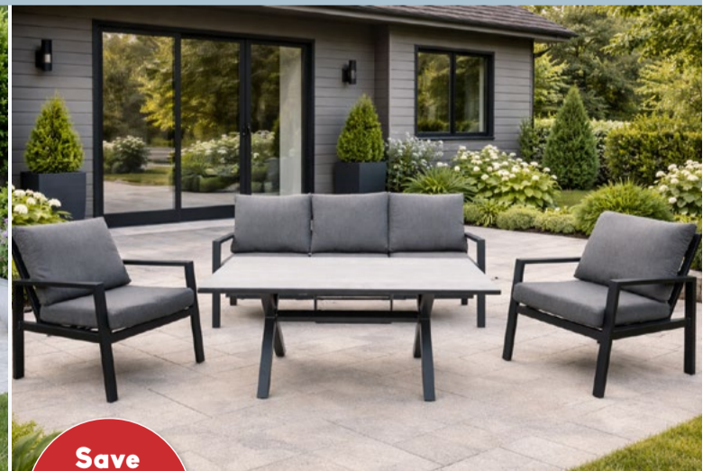
Save 30% off regular price Manchester Sofa Set 🛒 1,119 99 Reg. $1,599.99