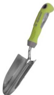
Garant® Botanica Hand Trowel 🛒 14 99