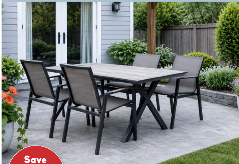
Save 30% off regular price Manchester Dining Set 🛒 909 99 Reg. $1,299.99