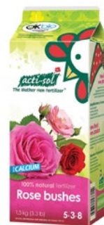
Acti-Sol Natural Fertilizer: Rose Bushes 🛒 12 99 /1.5 kg