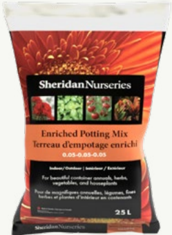
Sheridan Nurseries Potting Mix 🛒 12 99 | 25 L Buy 3 or more 10 99 each