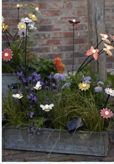
Solar LED Sunflower Garden Stake 🛒 15 99