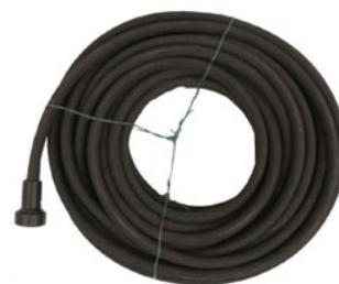
Greenhouse 3/8" Soaker Hose 🛒 19 99