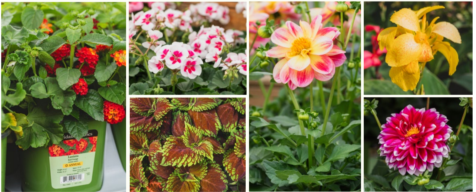
Sheridan Nurseries Annuals 🛒 12 99 | 6" pot