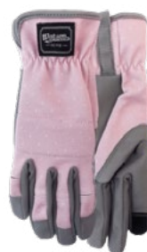
Uptown Girl Garden Gloves 🛒 19 99