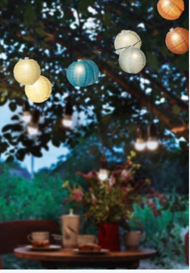
Solar LED Paper Lantern String Lights 🛒 19 99