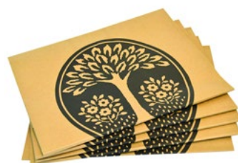
Sheridan Yard Waste Bags 🛒 4 99 /5 bags per package