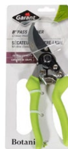
Garant Botanica By-Pass Pruner 🛒 16 99