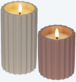
Outdoor LED Concrete Candle 🛒 Starting at 9 99