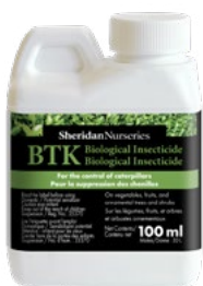
Sheridan Nurseries BTK 🛒 19 99 | 100 ml