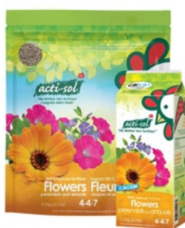
Acti-Sol Natural Fertilizer: Flowers, Perennials & Annuals 🛒 Starting at 12 99