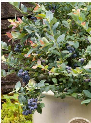
Blueberry Pink Icing® Bushel & Berry 8 00 | No. 1 pot. Reg. $39.99 (28FS8000)