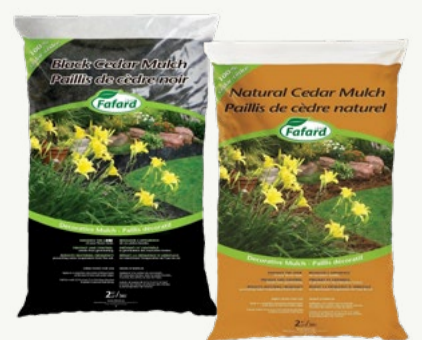
Fafard Cedar Mulch 🛒 7 99 | 56 L. Buy 5 or more 4 99 each

Selection varies by store. Prices valid while quantities last from May 21 to May 27, 2026.