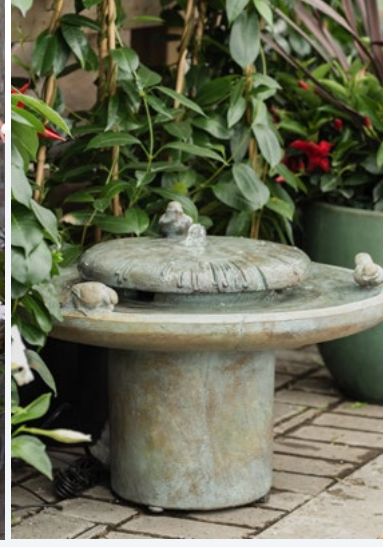
Birds of a Feather Fountain 999 99