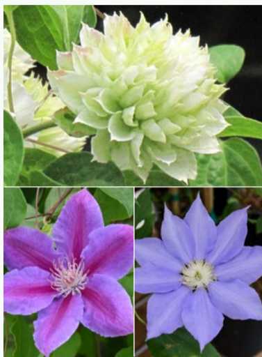
Triple Mix A Clematis (Dr. Ruppel, Duchess of Edinburgh, and H.F. Young) 20 00 | No. 3 deco pot. Reg. $79.99 (40FS2000)