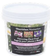
Sheridan Nurseries Plant Food 🛒 19 99 | 750 g