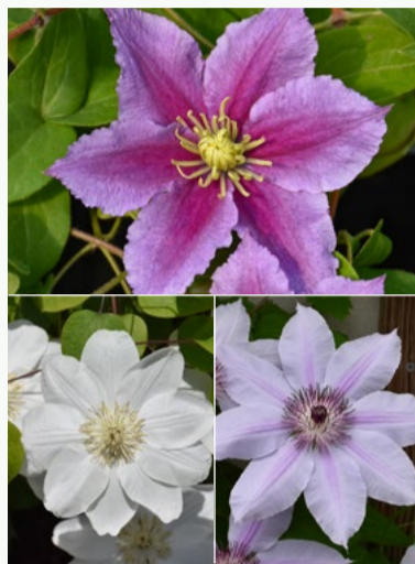
Triple Mix C Clematis (Nelly Moser, Guernsey Cream, and Mrs. N Thompson.) 20 00 | No. 3 deco pot. Reg. $79.99 (40FS2000)