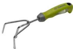
Garant® Botanica Cultivator 🛒 14 99