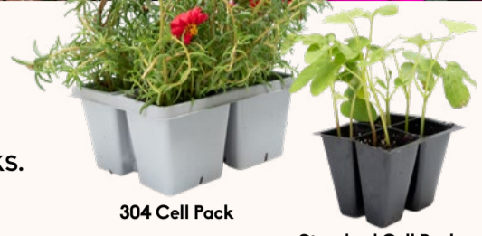
304 Cell Pack