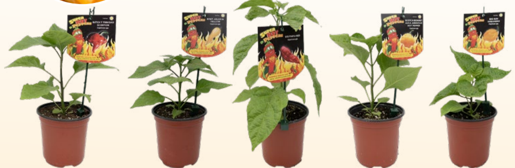
Butch T Trinidad Scorpion