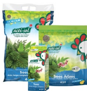
Acti-Sol Natural Fertilizer: Trees, Shrubs, Hedges & Evergreens 🛒 Starting at 12 99