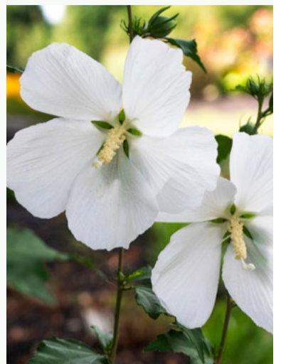
Diana Rose of Sharon 16 00 | No. 3 pot. Reg. $49.99 (17FS1600)