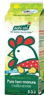
Acti-Sol Natural Fertilizer: Pure Hen Manure 🛒 12 99 /1.3 kg