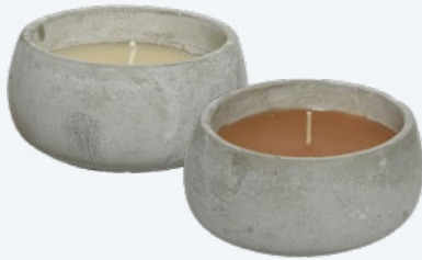
Outdoor Citronella Candle 🛒 7 99