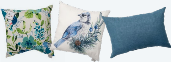
Outdoor Patio Pillows 🛒 Starting at 29 99