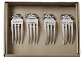
Mice Cheese Markers