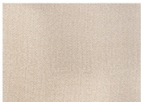
Tweed Table Luxe Reversible Placemat