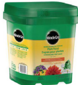
Miracle Gro Water Soluble All Purpose Plant Food