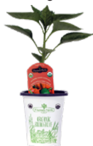
🛒 California Wonder Pepper