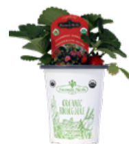
🛒 Strawberries Everbearing

Selection varies by store. Prices valid while quantities last from May 16 - June 5, 2024.