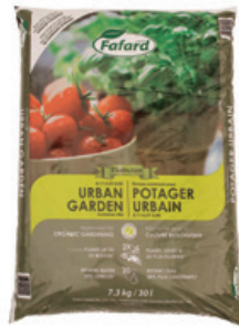
Fafard Urban Container Mix