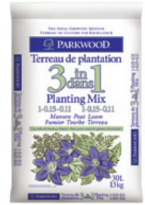
Parkwood® 3 in 1 Planting Mix 🛒 5 99