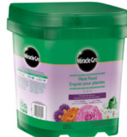
Miracle Gro Water Soluble Ultra Bloom Plant Food