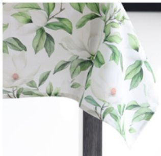
White Blossom Water Repellent Tablecloth