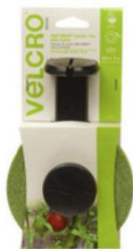
Velcro with Cutter