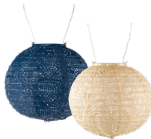
Globe Solar Lantern