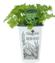
🛒 Italian Parsley