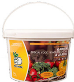
Nutrite Garden Special