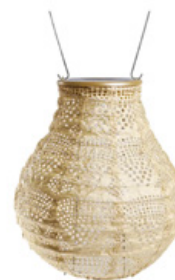
Bulb Pearl Solar Lantern