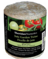
Sheridan Nurseries Jute Twine