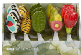
Botanist Garden Spreaders