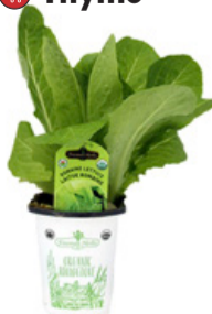
🛒 Romaine Lettuce