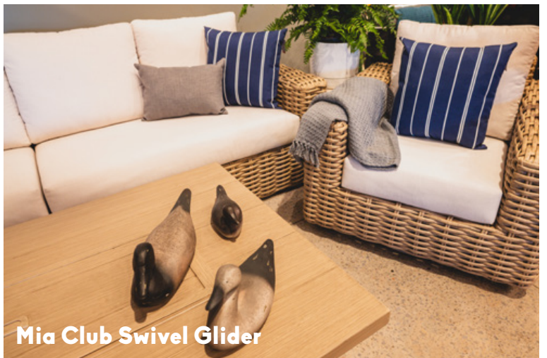
Mia Club Swivel Glider