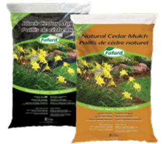
Fafard Cedar Mulch