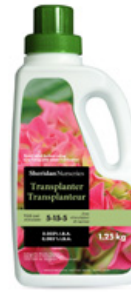
Sheridan Nurseries Transplanter