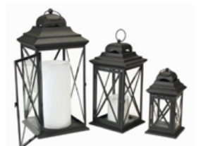
Iron Lantern with Glass