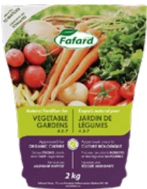
Fafard Fertilizer for Vegetable Gardens