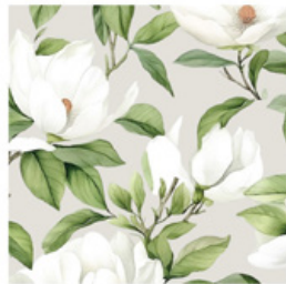
White Blossom Printed Napkins