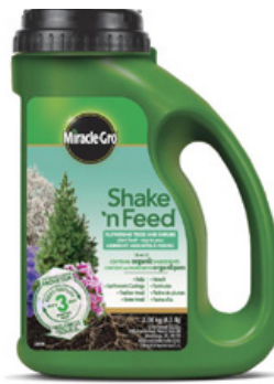
Miracle Gro Shake N' Feed Flowering Trees & Shrubs 🛒 17 99 | Reg. 22 99 2.04 Kg