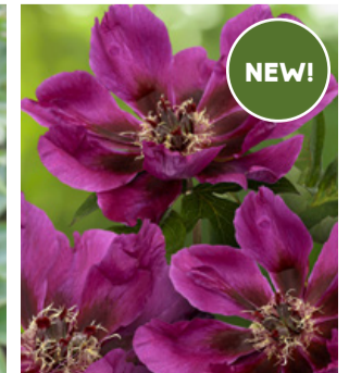
Purple Sensation 64 99 | 15cm pot