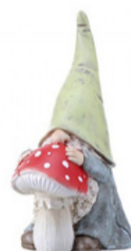
Gnome Leaning on Mushroom 🛒 39 99