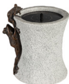
Climbing Frog Sand Stone Fountain 🛒 299 99