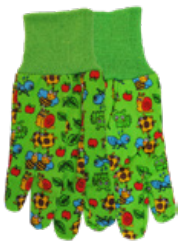
L'il Buggers 🛒 5 99