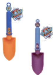
Paw Patrol Trowels 9 99