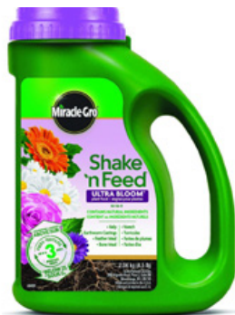
Miracle Gro Shake N' Feed Ultra Bloom 🛒 17 99 | Reg. 22 99 2.04 Kg