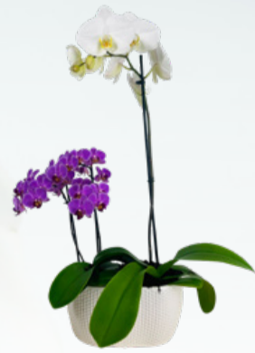
Orchids Mama & Mini Pot 69 99 | 8"