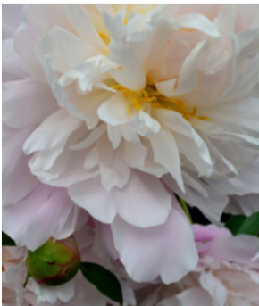
Catharina Fontijn 39 99 | No. 2 pot