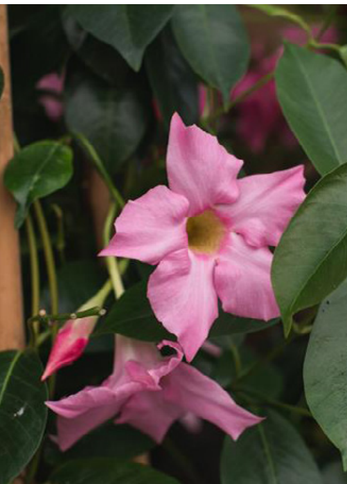
Mandevilla Trellis 59 99 | 10'