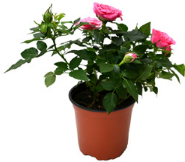
Mini Roses Starting at 7 99 | 4"