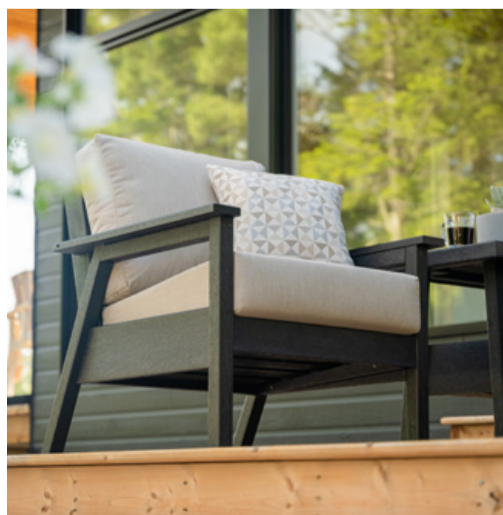
Tofino Armchair with Cushion 🛒 899 99