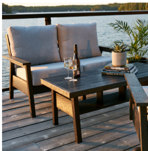
Tofino Loveseat with Cushion 🛒 1899 99