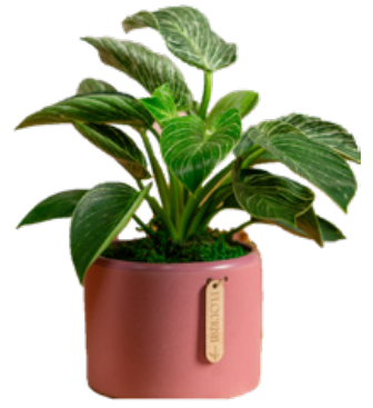
Daphne Assorted Foliage 49 99