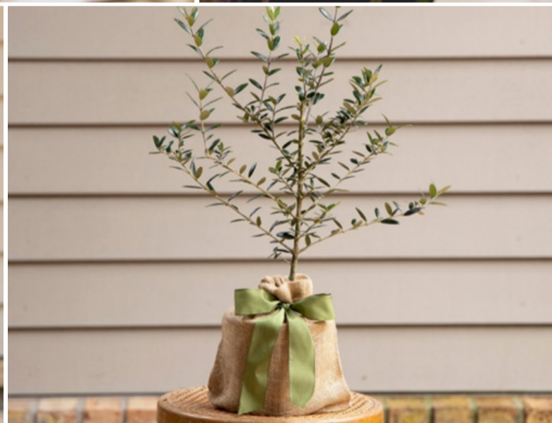
Olive Tree in Burlap 99 99

Brighten Mom's day with BEAUTIFUL BLOOMS