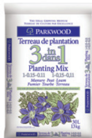
Parkwood 3 in 1 Planting Mix 🛒 5 99 Buy 5 or more 4 99 each | 30 L