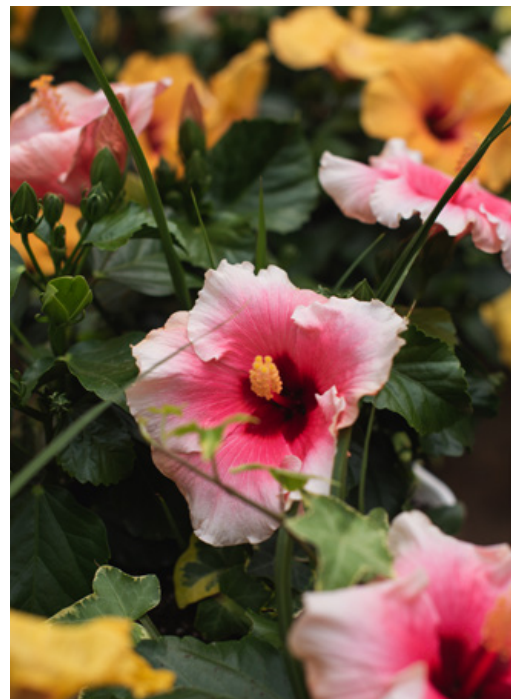
Hibiscus Standard 69 99 | 10'