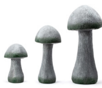
Grey Mushrooms 🛒 Starting at 59 99