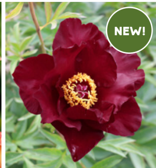
Lafayette Escadrille 64 99 | 15cm pot