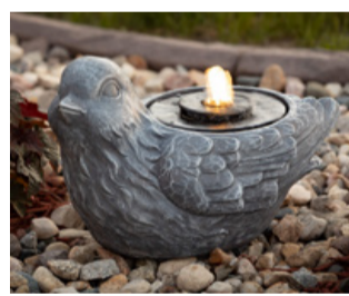
Bird Fountain LED 🛒 299 99