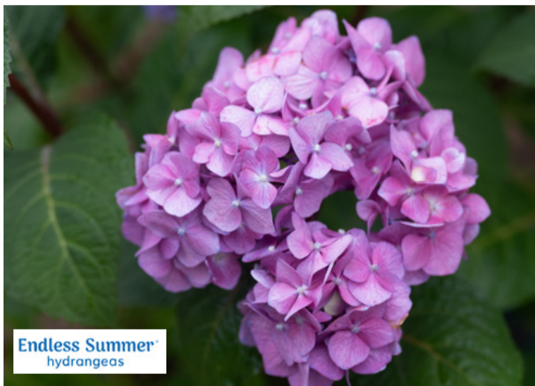
The Original Blue Hydrangea 🛒 44 99 | No. 2 pot