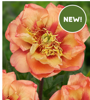
Orange Victory 64 99 | 15cm pot