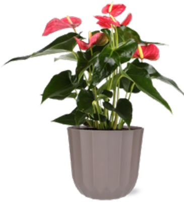
Anthuriums in Deco Pot 34 99 | 7"