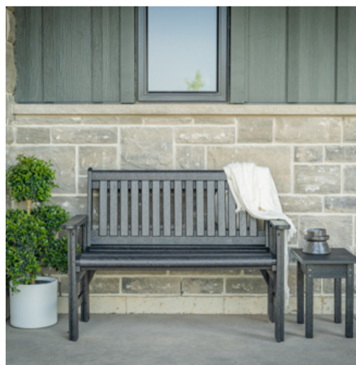
4' Garden Bench 🛒 899 99

Limited Home Décor selection at our Toronto (Yonge Street) and Georgetown locations. For full selection, shop online.