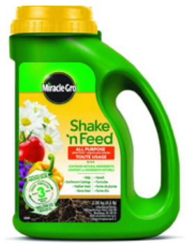
Miracle Gro Shake N' Feed All Purpose 🛒 17 99 | Reg. 22 99 2.04 Kg