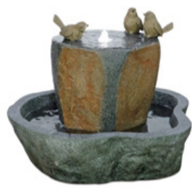
Fountain Bubbler with Birds 🛒 699 99