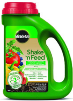
Miracle Gro Shake N' Feed Tomatoes, Fruits & Vegetables 🛒 17 99 | Reg. 22 99 2.04 Kg