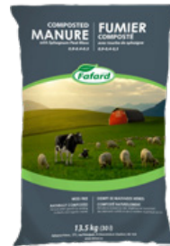
Fafard Cattle Manure 🛒 5 49 | 25/30 L Buy 5 or more 4 99 each