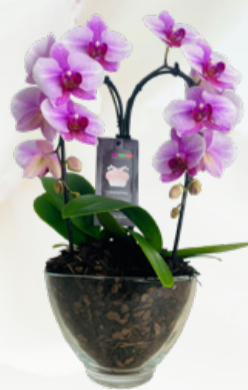
Mini Cascade in Glass Pot 59 99 | 6"

Designed exclusively for Sheridan Nurseries