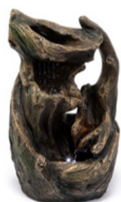
Driftwood Water Fountain 🛒 119 99