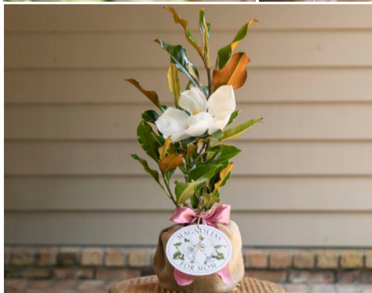
Southern Magnolia Tree in Burlap 99 99