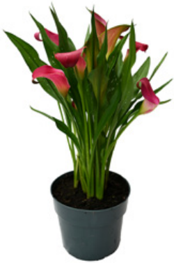
Cala Lilies 24 99 | 6"