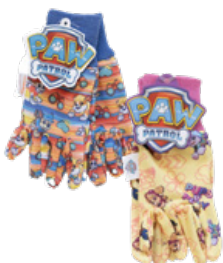
Paw Patrol Gloves 9 99