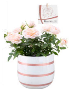
Mini Rose in Striped Ceramic Pot 19 99