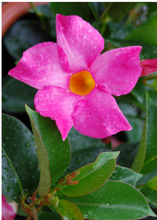
Dipladenia Bush Pink 29 99 | 6'