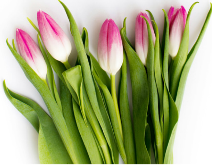
Fresh Cut Tulips Starting at 16 99 | 10 Stem Bunch