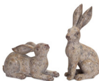
Rabbit Statue 🛒 49 99