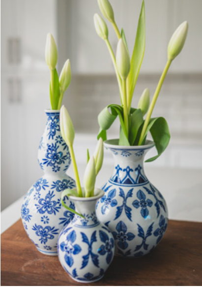
Blue & White Porcelain Bud Vase Starting at 22 99 | Each