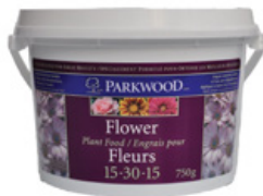
Parkwood 15-30-15 Flower Water Soluble 🛒 15 99 | 750 gm