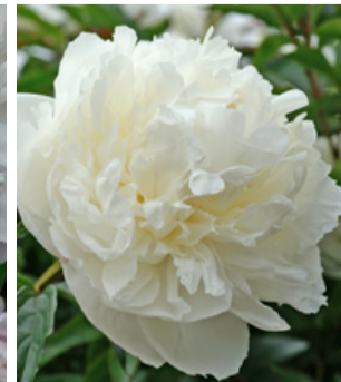
Marie Lemoine 39 99 | No. 2 pot

Selection varies by store. Prices valid while quantities last from May 9 to May 15, 2024