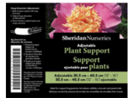
Sheridan Nurseries Plant Support 🛒 5 99