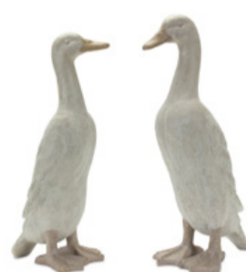
Standing Tall Duck Statue 🛒 69 99