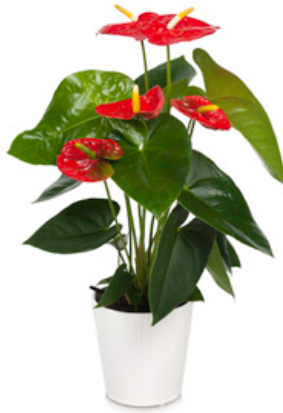
Anthuriums in Ceramic Pot 19 99 | 5"