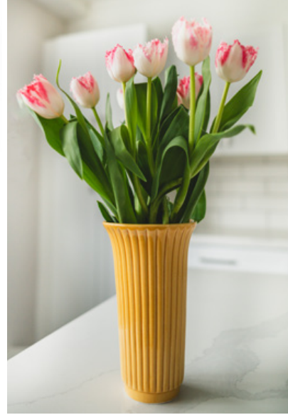
Daisy Glazed Vase 64 99