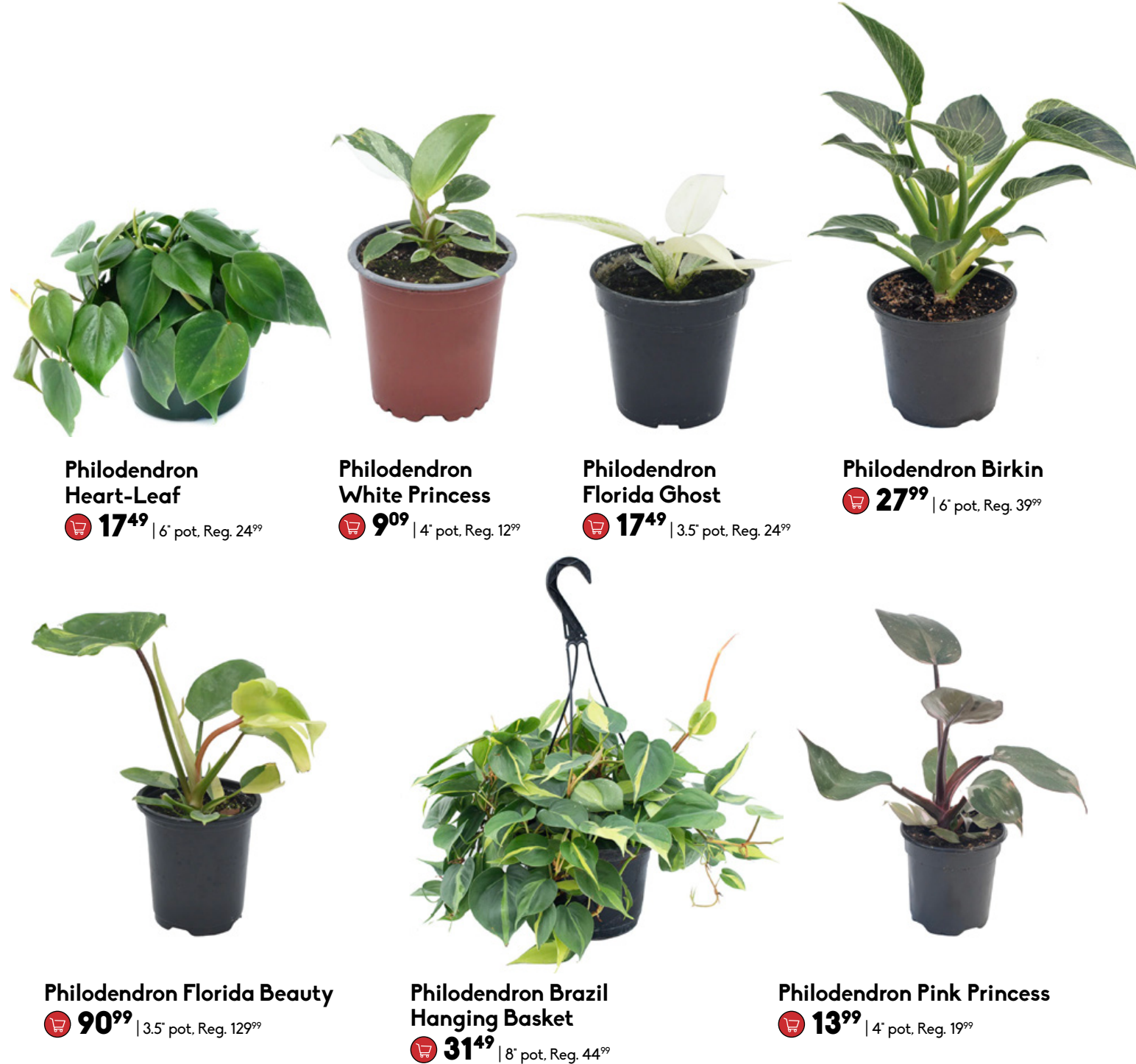
Philodendron Heart-Leaf $17 49 | 6" pot, Reg. 24 99