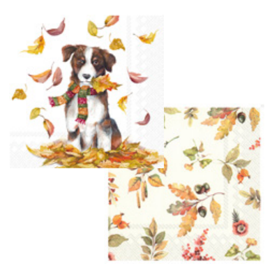
Napkins Pumpkin Love 699