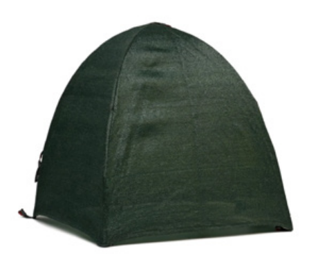
Winter Shrub Cover 24 <sup>99</sup> | 28" × 30"