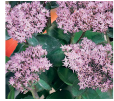
Autumn Joy Stonecrop 9 00