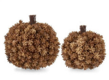
Pincone Pumpkin with Twig