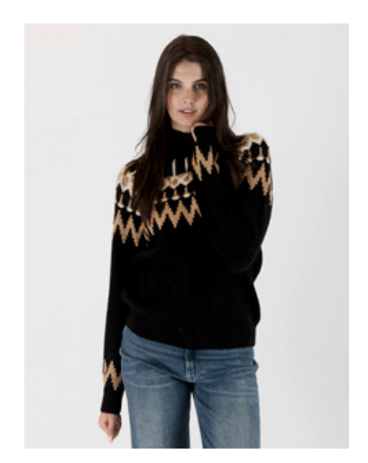
Fairisle Mock Neck Sweater 130 00