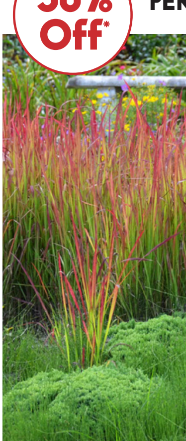
Red Baron Ornamental Grass