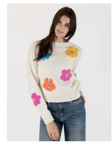
Sweater with Colourful Flowers