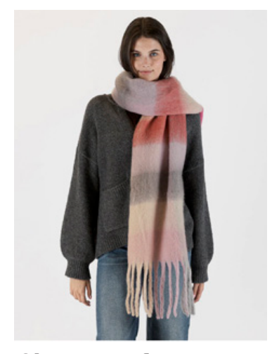
Check Scarf Rust