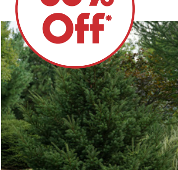
White Spruce 4199