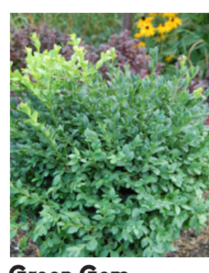
Green Gem Boxwood 31 <sup>49</sup> No. 3 pot. 'Reg. 4499