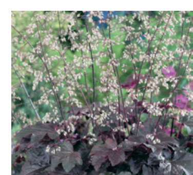
Purple Palace Coral Bells 1000