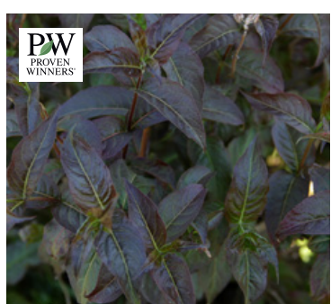
Kodiak® Black Diervilla