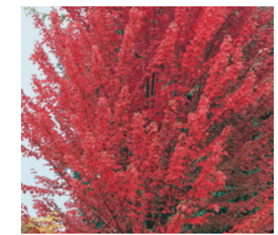
Autumn Blaze® Freeman Maple