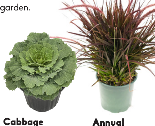
& Kale 999 6" pot , 1499 10" pot