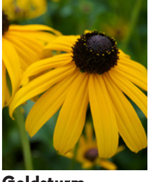
Goldsturm Black-eyed Susan 9 00