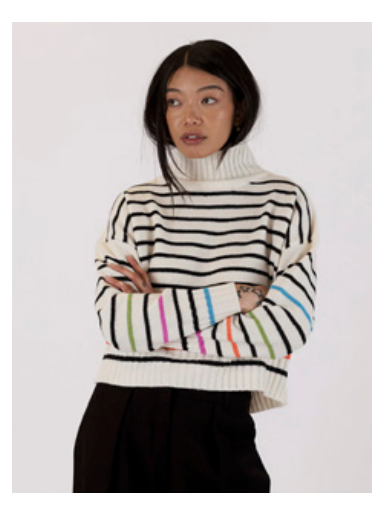
Mock Neck Striped Sweater 13000