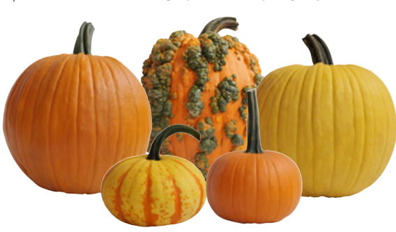
Starting at 3<sup>99</sup> to 9<sup>99</sup> leach

Pumpkins grown locally at Sheridan Nurseries Glen Williams Farm