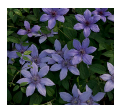
Bernadine Clematis 20 00