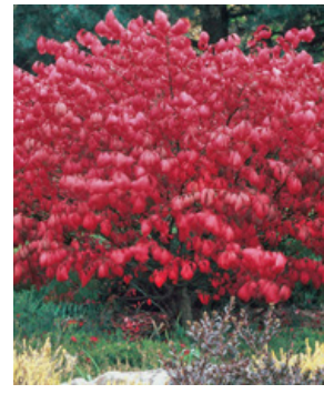
Dwarf Burning Bush