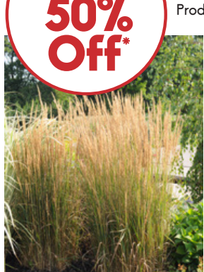
Karl Foerster Ornamental Grass 10 00