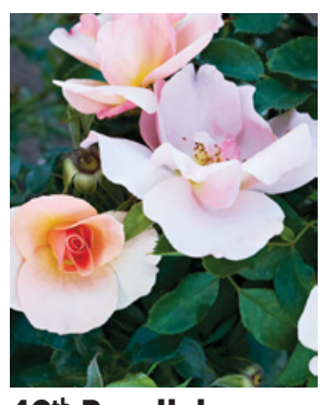
49th Parallel Rose Collection Chinook Sunrise