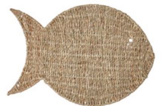
Charger Seagrass Fish 🛒 14 99

Home Décor not available at Georgetown location. Limited Patio Furniture and Home Décor at Toronto (Yonge St. location). For full selection, shop online.