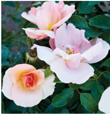
49 th Parallel Collection Chinook Sunrise™ Rose