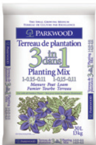
Parkwood® 3 in 1 Planting Mix

Pre-mixed and ready to use. Suitable for all your garden needs.