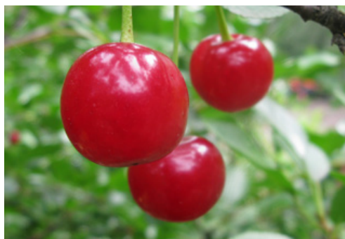
Romeo Cherry 89 99 | No. 5 pot