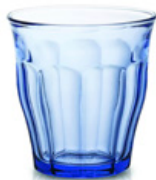
Picardie Duralex Tumbler, Set of 4 🛒 24 99