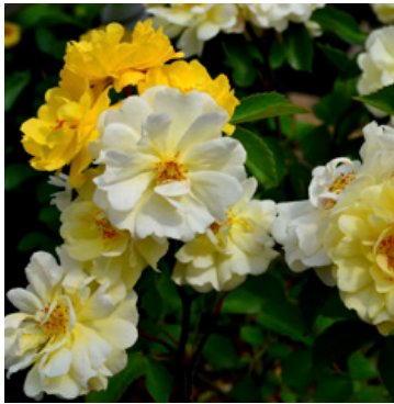
Colour Cocktail Rose