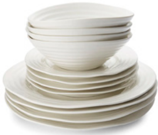
Sophie Conran 12 Piece Dinner Set 🛒 299 99