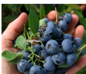
Northland Blueberry 19 99 | No. 1 pot