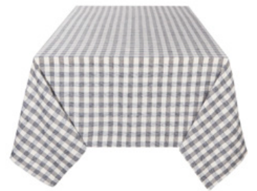
Twisted Grey Tablecloth 🛒 89 99