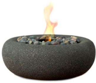
Zen Indoor/Outdoor Fire Bowl 🛒 169 99