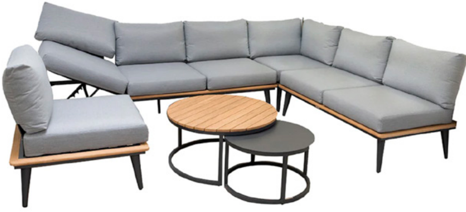
Bloor Sectional 5 Piece Set 🛒 7999 99