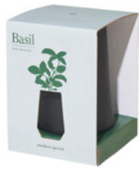
Tumbler Basil Grow Kit 🛒 49 99