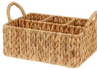
4 Part Basket With Handles 🛒 39 99