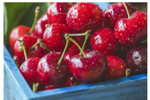
Valentine Cherry 89 99 | No. 5 pot