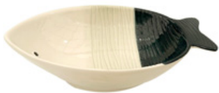
Bowl, Fish 🛒 29 99