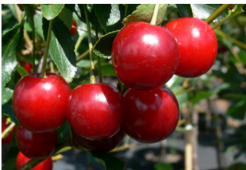
Cupid Cherry 89 99 | No. 5 pot

These super sweet cherries were bred in Canada at the University of Saskatchewan. This hardy, high-yielding collection of cherry bushes are dwarf in size and fit nicely into small spaces. They are perfect for baking, cooking and preserving.