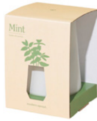
Tumbler Mint Grow Kit 🛒 49 99