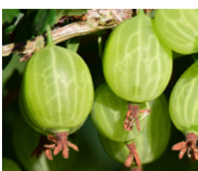
Pixwell Goosberry 19 99 | No. 1 pot