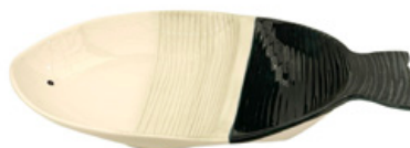
Serving Dish, Fish 🛒 34 99