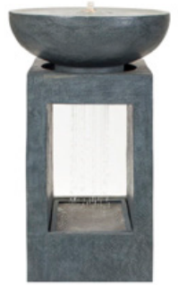
Resin Fountain 🛒 999 99