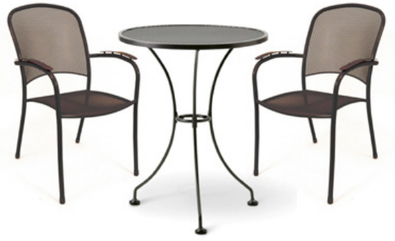
Round Mesh Bistro, 24" 🛒 299 99 Carlo Armchair 🛒 219.99 each