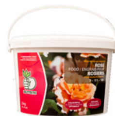
Nutrite® Rose Food

Helps with blooms and healthy growth of roses.